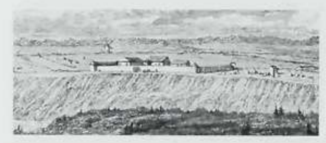
Fort Edmonton on the North Saskatchewan River, about 1870.