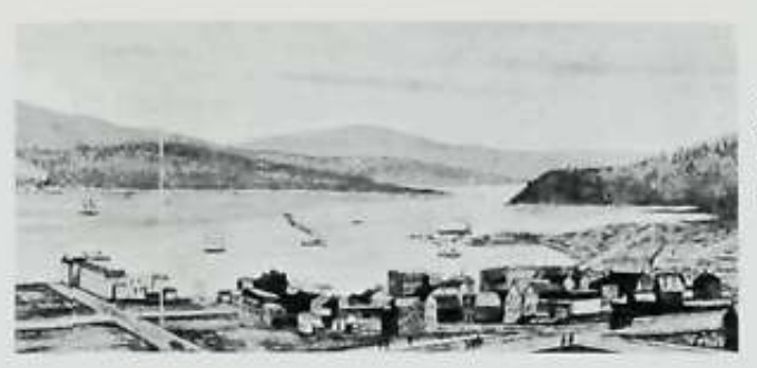
The site of Vancouver in 1867 was only a landing place for fur traders and adventurers. By 1888 it had a population of 10,000 and had already been incorporated as a city.