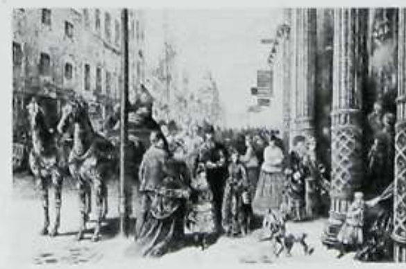
St. James Street, Montreal, on a winter afternoon in 1875.