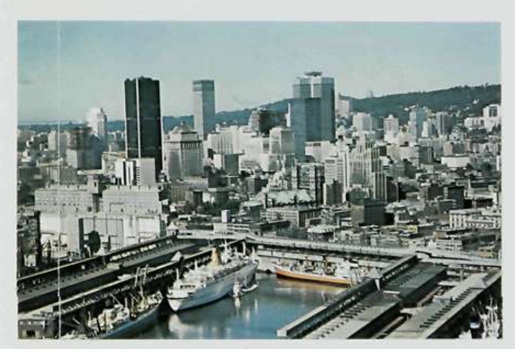
Montreal, founded in 1642, became a city in 1832—to its population of about 100,000 in 1867 it has added more than 2,300,000.