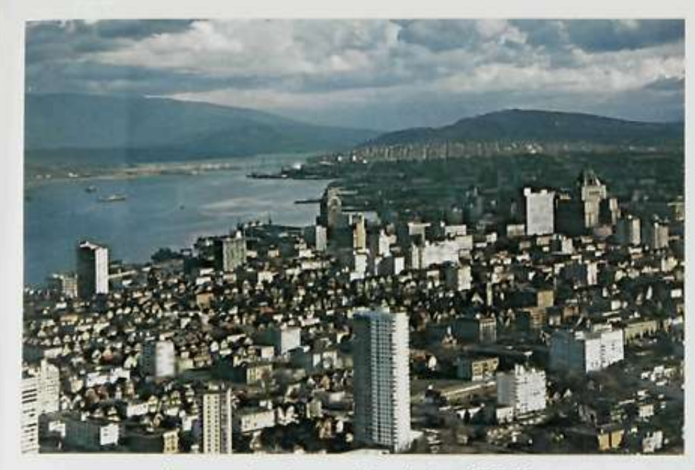
Vancouver today has a population of almost 1,000,000.